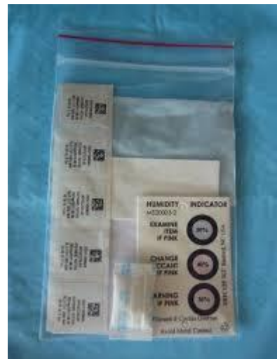
DBS card in small ziplock bag