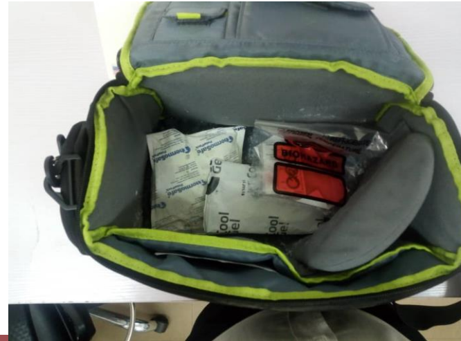
DBS in cold shipment bags